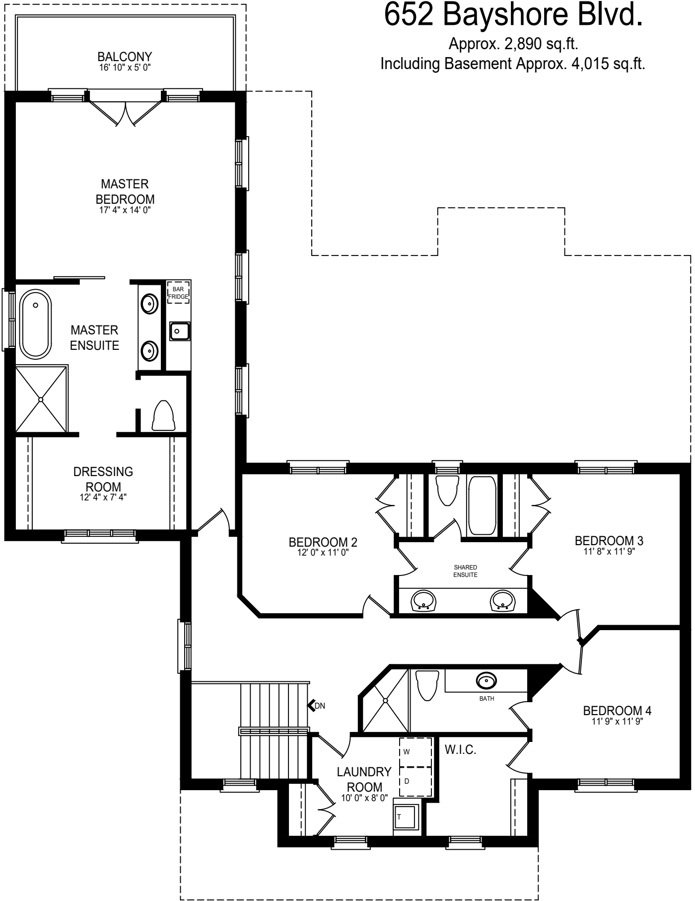
SECOND FLOOR PLAN APPROX. 1,765 SQ.FT.